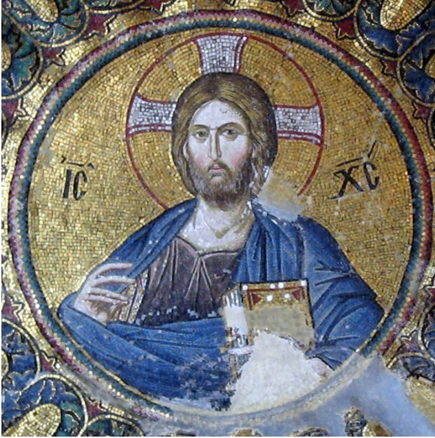
Mosaic from Kariye Camii showing Christ Pantocrator (1315-1321)

Te whare karakia matua o Pita Tapu ki Waikato stpeter.org.nz