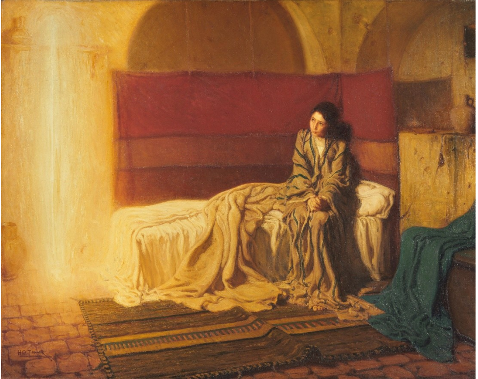
Henry Ossawa Tanner, The Annunciation, 1898

Te whare karakia matua o Pita Tapu ki Waikato stpeter.org.nz